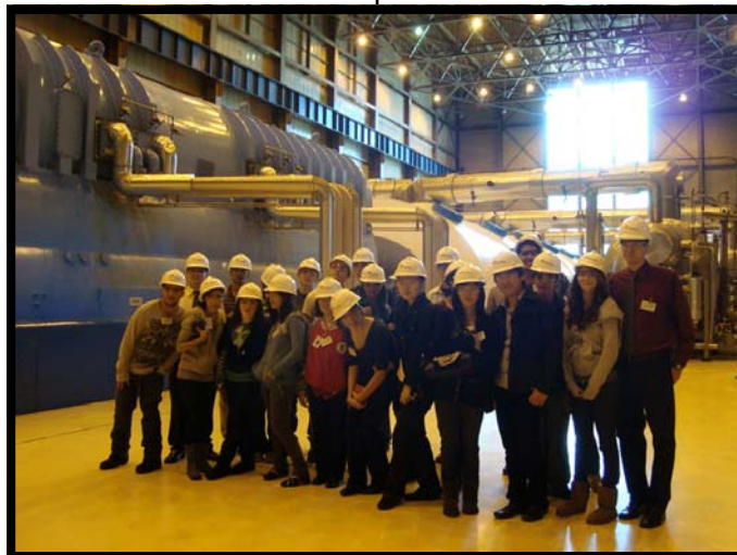
Indian Point hosts Garden's Sophomores and Seniors