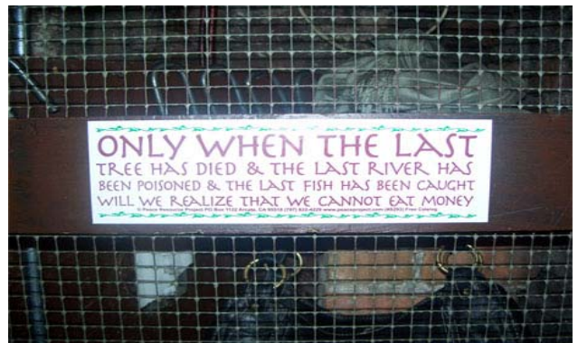
Message to the World from Mandiba Restaurant