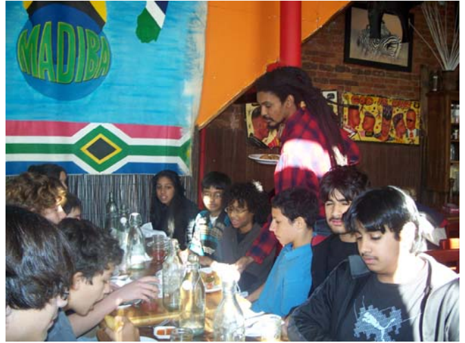
Eighth Grade @ Mandiba Restaurant