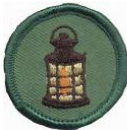
Underground Railroad Badge

The Kindergarten wrapped up February with lessons on Harriet Tubman, The Underground Railroad and dental health. As we spring into March, the children are excited about new topics that include legends from the British Isles and Ireland. They are intrigued with stories of Nessie, the Loch Ness Monster. The students have created new art work in the classroom, with inspirations of Spring, rainbows, and the new artist they have been learning about, Andy Warhol.